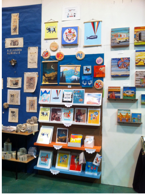
4' x 8' Wall w/ no corners