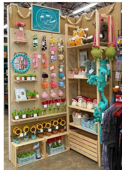
8' x 8' Wall w/ 90 degree corner