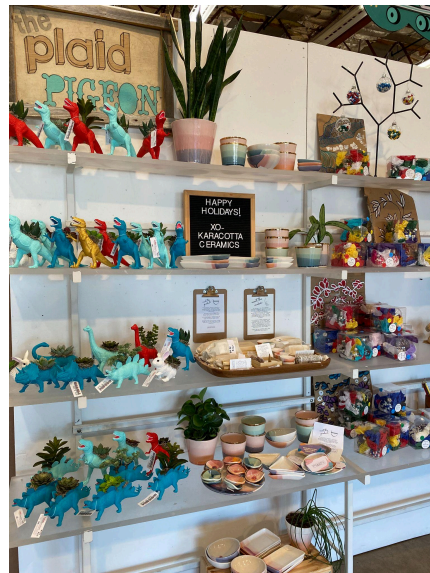
Display Shelves featuring multiple artists