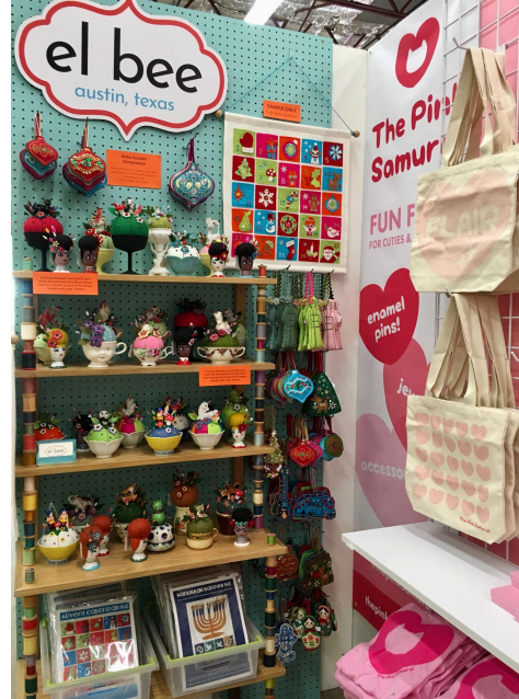
4' x 8' Wall w/ shared corner on right